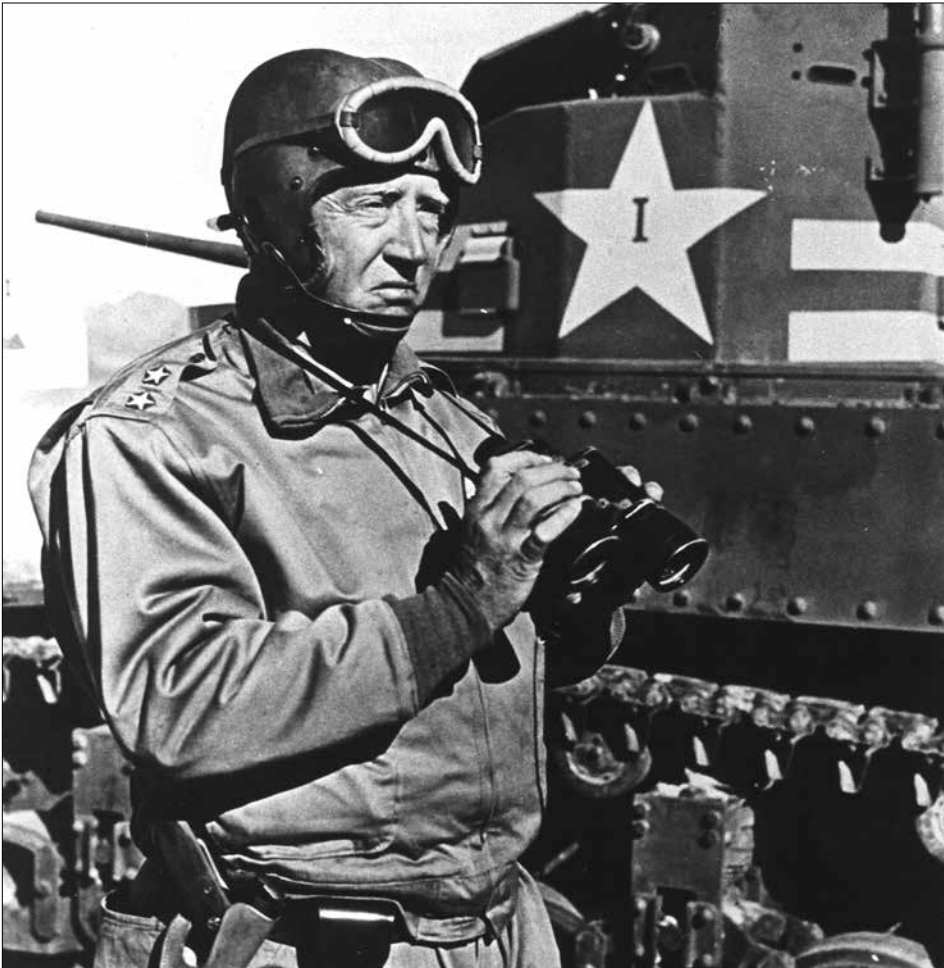
General George S. Patton