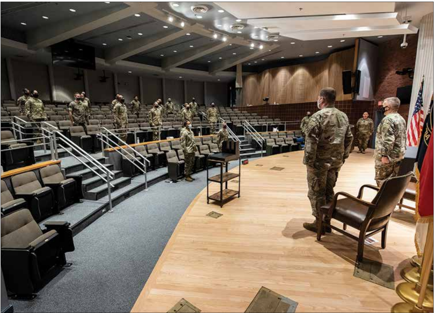
Soldiers wear masks and stand socially-distanced during the WOBC graduation ceremony last August inside Decker Auditorium at TJAGLCS.