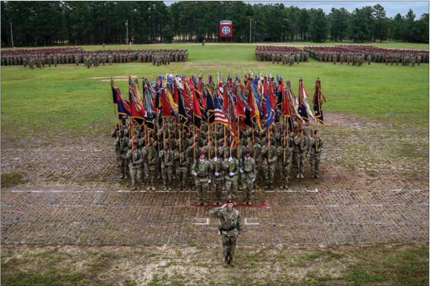
The 82d Airborne Division changes command at Fort Bragg, NC.