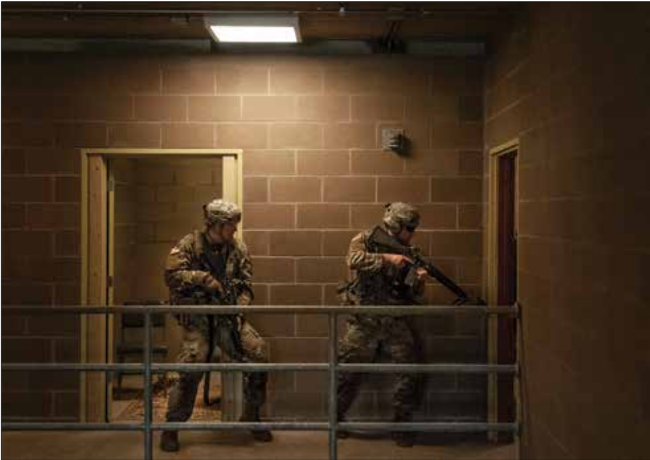
U.S. Army paralegal specialists search an apartment complex floor by floor during a hostage rescue training mission on Fort McCoy, Wisconsin, during 2019 Paralegal Warrior Training Course, July 22, 2019.